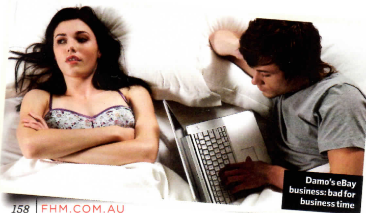
Damo's eBay business: bad for business time

good news is that most women don't expect or want porn-style, marathon sex. It's hard to say how long it should typically last as every woman's wants and needs are different, but if you're consistently only able to last a minute or two inside her, then you might want to talk to your doctor. That said, if you're able to satisfy her in other ways - through oral sex or with sex toys - she might not care that you come faster than Usain Bolt runs the 100.